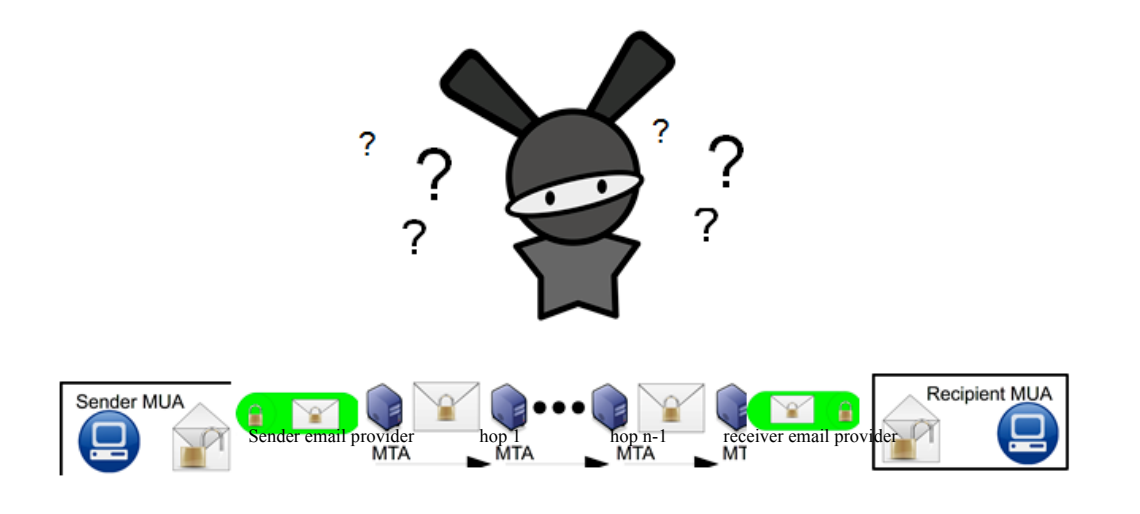
Fig. 2 Message secured with end-to-end encryption (s/MIME or PGP)

architecture: messages would pass through multiple intermediate servers, each of which would store the message for an indeterminate period of time before passing it on.