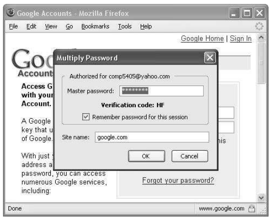
Figure 2: The dialog box for P-Multiplier is activated by double-clicking on the password field

Password Multiplier (hereafter identified as P-Multiplier) is a second password manager intended to help users generate strong passwords for web accounts [11]. It is a plug-in for Mozilla's Firefox web browser, requiring no changes to the servers; all computation is done client-side. As with PwdHash, a cryptographic hash function is applied, generating strong passwords for the user's accounts. primary design goal of PwdHash is to protect web site passwords against phishing attacks, P-Multiplier is intended to generate and manage strong passwords from a single user-chosen password for arbitrary passwordprotected applications (i.e, not restricted to web site passwords); this difference does not affect our usability study, and the plug-in we tested is restricted to web site passwords. P-Multiplier uses a master username and master password so that users need only remember one password for all of their accounts. A protected password is generated based on the master username,