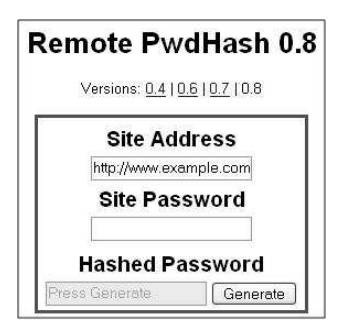
Figure 1: Remote web site for generating PwdHash passwords

@@ character, processing so-designated passwords, and replacing the input, before JavaScript would have access. PwdHash also protects against phishing attacks by using a hash salt based on the domain name of the target web site. If users enter their password at a fraudulent site, that site's domain will be used as the salt.