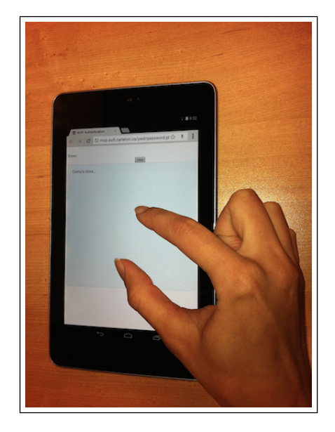
Figure 1: Example of Pinch In Gesture on GesturePass (with thumb and index finger)

GesturePass was deployed as a part of the existing MVP framework [1], a system specifically designed for conducting research studies of authentication schemes. GesturePass contains about 100 lines of PHP, and about 200 lines of JavaScript. The PHP code runs on the server, and generates JavaScript code that runs in the web browser. The code was adapted from the Hammer JavaScript event logger sample program [2].