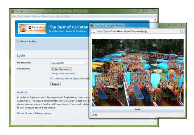
Figure 2: The login interface for a phpBB forum using PassPoints as an authentication scheme.

line stores, and the MediaWiki platform. Figure 2 provides a screenshot of the login interface for a phpBB forum using PassPoints as an authentication scheme. In lab and field studies, websites based on these systems are fully populated with real content to engage users realistically.