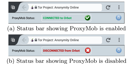
Figure 2: The proposed ProxyMob status bar

To make it more visible, we propose placing a ProxyMob status bar beneath Firefox's address bar. As shown in Fig. 2, the status bar informs the user whether the add-on is enabled (i.e., the user is connected to Orbot) or disabled (i.e., disconnected from Orbot). The status bar has a power button which the user can use to enable or disable the add-on. The ideal status bar would also include information about